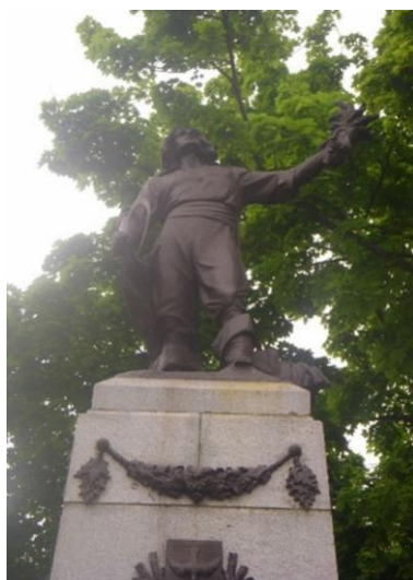
On top is a statue of Louis holding a sheaf of grain in one hand and a sickle in the other.